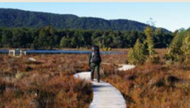
Day 4: Moturau Hut to the Kepler Track car park